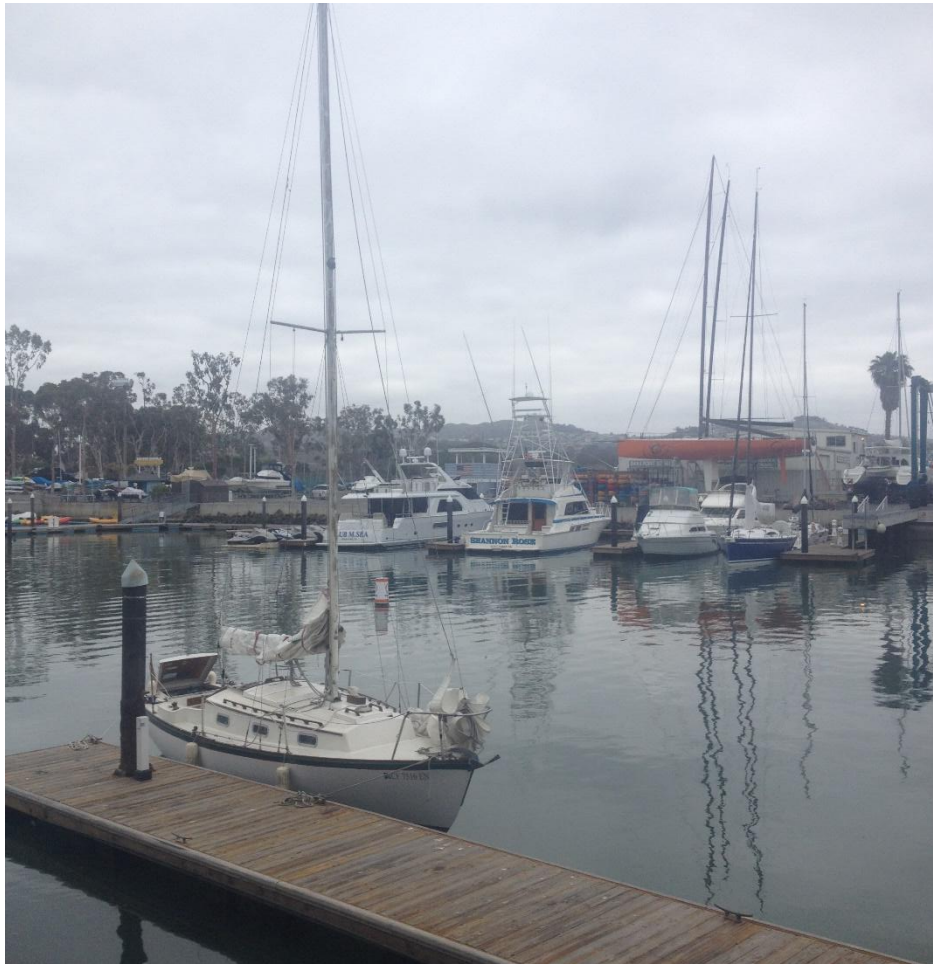
Morning at Dana Point

In light winds I tacked in close to the coast. The freeway goes behind these hills because they drop steeply down to the coast. I thought it would be good to go in close and see the fancy houses and keep an eye out for cool architecture and church steeples. Only in Laguna Beach did I see a church tower. This one in some sort of Spanish-Romanesque form.